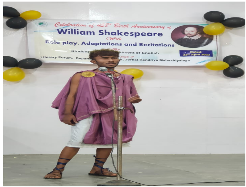
Stills from the Play Twelfth Night